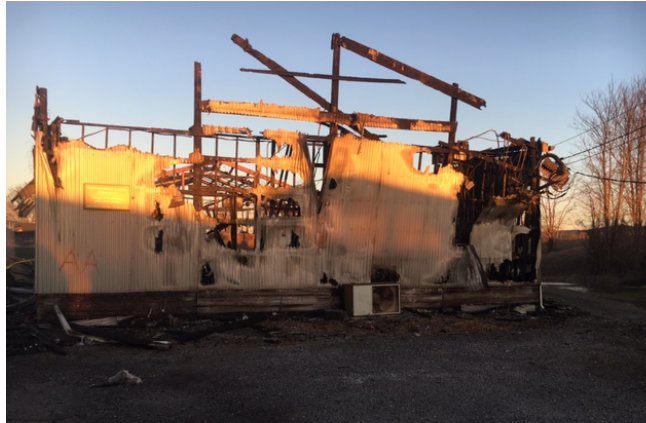
East View After Fire