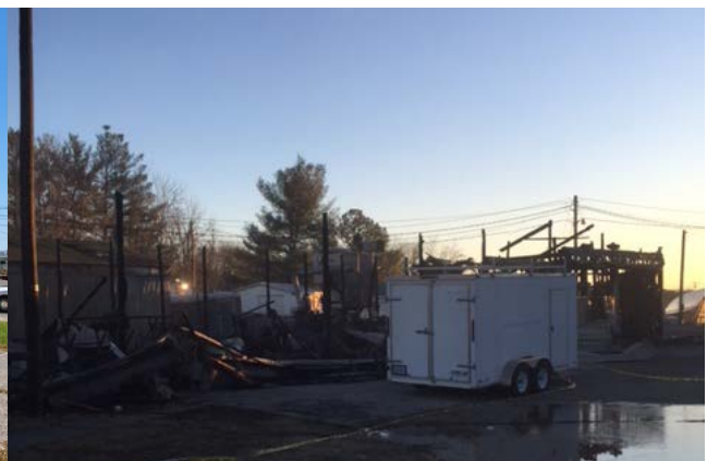
Southwest View After Fire