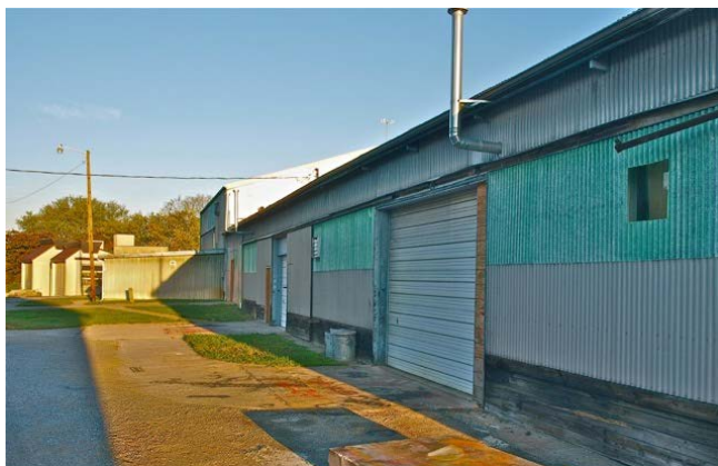
Southwest View Before Fire