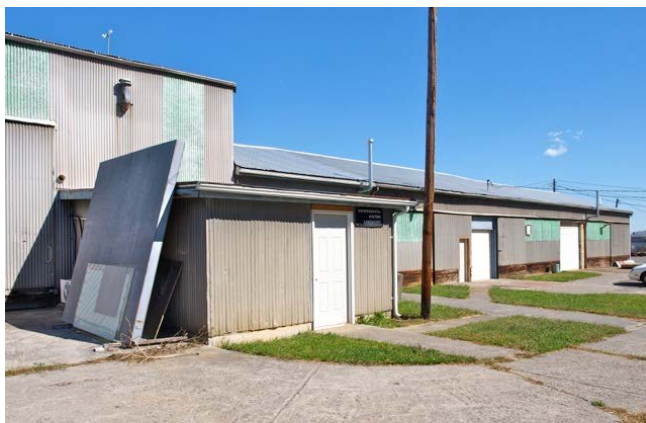
Southwest View Before Fire