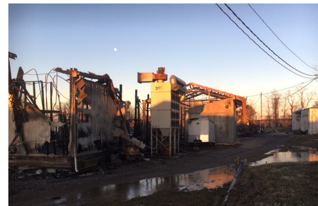
Northeast View After Fire